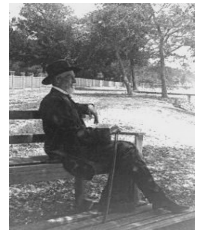
Jefferson Davis at Beauvoir around 1885