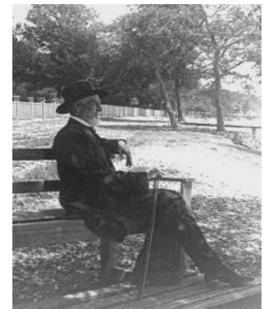
Jefferson Davis at Beauvoir around 1885